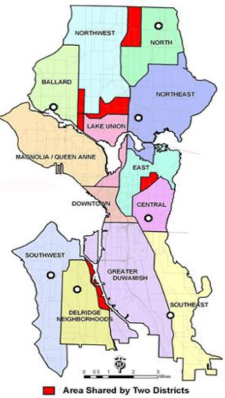
O Neighborhood Service Centers

Surveillance ordinance : Seattle City Council passed ordinance <u>125376</u>, also referred to as the "surveillance ordinance."